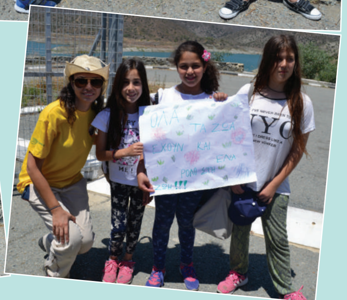
« Pleasant Cooperations »