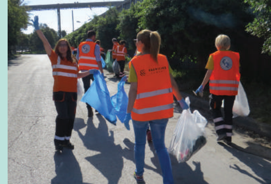
Let's do It Cyprus 2016