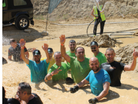
Legion Run 2016