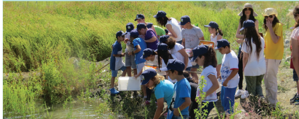
Getaway to Nature