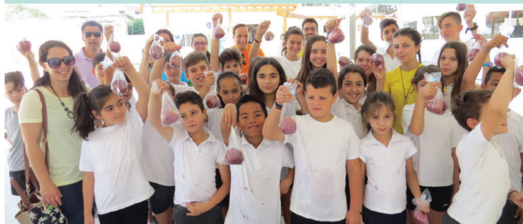
Universal Children's Day-Delivery of Apples