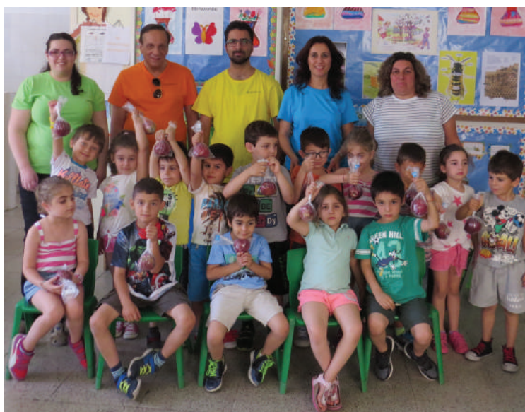
We also supported UNICEF's organization action to assist children in real need, buying fresh apples from the organization and delivering them to elementary schools and pre-elementary schools of neighboring communities. Income will be used for the purchase of basic staff for destitute children.