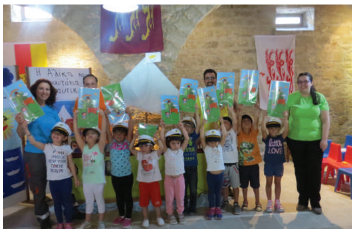
School visits were carried out to five neighboring communities where a presentation was delivered on Health & Safety at school, on the street and at home distributing to children a game with instructions and advice on their Safety.